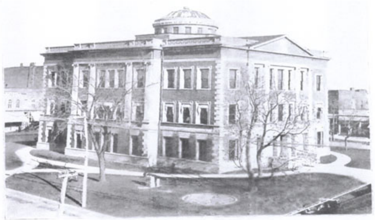
PLATT COUNTY COURT HOUSE, MONTICELLO